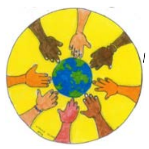
Liyana, Oak Class

I pledge to use my words in a kind way, I pledge to help others as I go throughout my day, I pledge to care for the Earth with my healing heart and hands, I pledge to respect people in each and every land, I pledge to join together as we unite the big and small, I pledge to do my part to create peace for all!